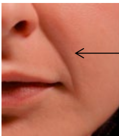
Figure 1. Facial Nasolabial Fold

BELOTERO BALANCE® (+) is used to smooth out and fill in moderate to severe folds or wrinkles, such as the creases that extend from the corner of the nose to the corner of the mouth ( nasolabial folds ) as shown in Figure 1 below.